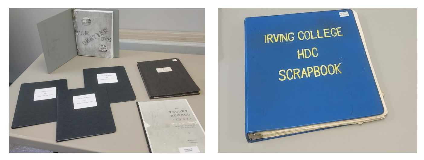
Irving College High School Memorabilia