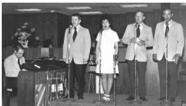
This photo taken at one of the many concerts presented by the group.