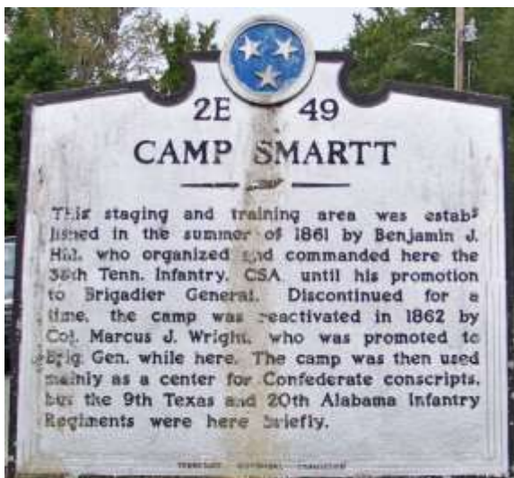
Camp Smartt, located on this site, was a staging and training area for the CSA.