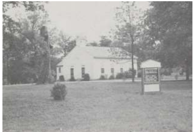
Historic old Liberty Cumberland Presbyterian Church