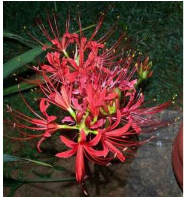
Red Spider Lily