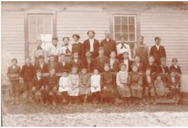
Photo of several early church members.