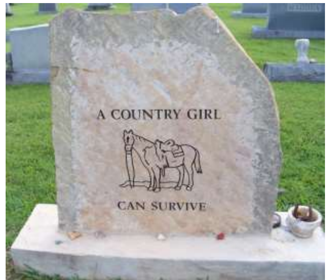
This is the second in a series of unique grave markers you will find in some of our local cemeteries.

Let me know if you run across one of interest