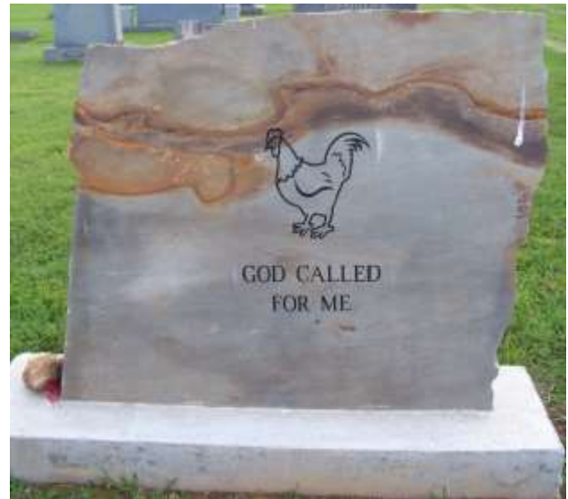
These unique stones are shipped and are polished and scribed by a local monument company.