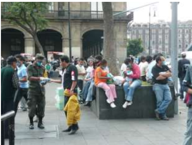
Army officer handing out facemasks in Mexico City

There's no doubt that WWI overshadowed the Spanish Flu locally when you start looking at our local newspapers. Very few papers can be found that were published during the time period of 1918-1919. Those that were preserved dedicated most of their coverage to the WWI effort.