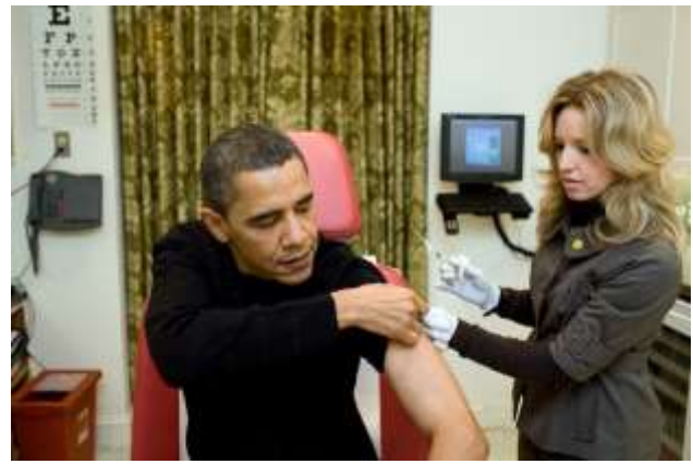
A White House nurse prepares to administer the H1N1 vaccine to President Barack Obama at the White House on Sunday, Dec. 20, 2009.

The 2009 flu pandemic in the United States was a novel strain of the Influenza A/H1N1 virus, commonly referred to as "swine flu" that began in