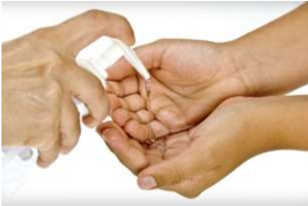
Swine Flu Prevention – The Dr. Oz Show.

On January 15, 2010, the CDC released new estimate figures for swine flu, saying it had sickened about 55 million Americans and killed about 11,160 from April through mid-December. On February 12, 2010, the CDC released updated estimate figures for swine flu, reporting that, in total, 57 million Americans had been sickened, 257,000 had been hospitalized and 11,690 people had died (including 1,180 children) due to swine flu from April through to mid-January.