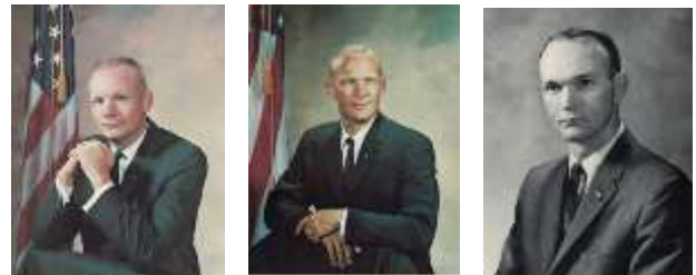
Astronauts Neil A. Armstrong, Edwin E. Aldrin, Jr. and Michael Collins.