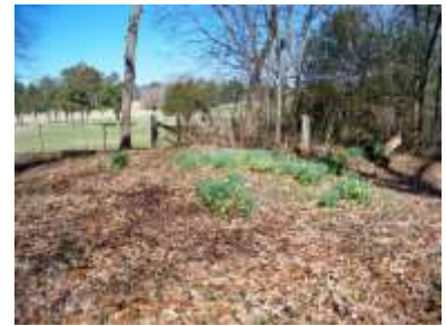
This is thought to be where the Church house was located.