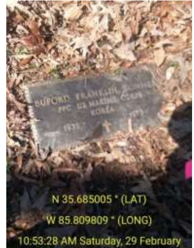
This photo was taken by J.B. Brown and shows the GPS location for this grave. It is accurate within 4 foot of the object.