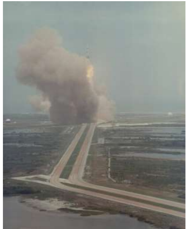
It was a long way out to the launch pad.