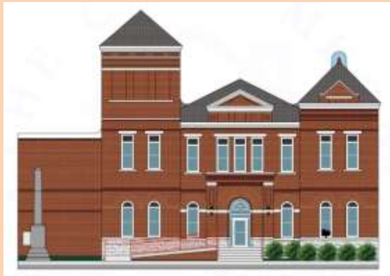
The Courthouse, McMinnville, TN (First in a series)

Would you like a piece of Warren County History? Our Keepsakes are a great way to have it