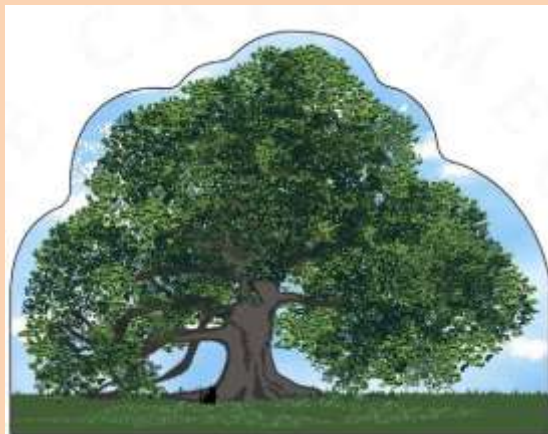
The Birthing Tree, McMinnville, TN (Third in a series)