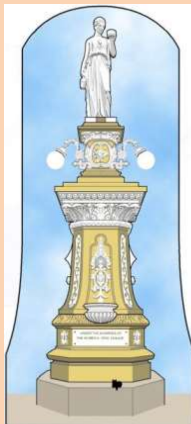
Hebe, McMinnville, TN (Forth in a series)

All four available for $18 each and may be purchased at Warren Co. Genealogical Association County Administrative Building, 201 Locust St. Open Mondays and Fridays 9:00-3:00 p.m