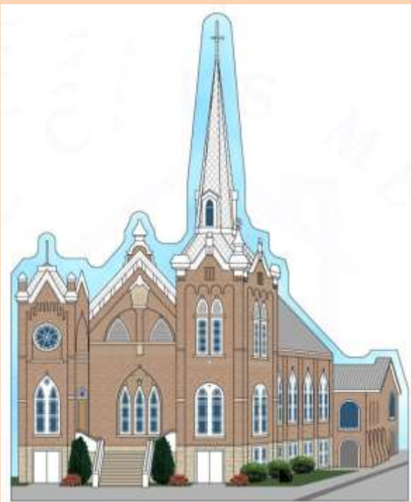
First Methodist Church, McMinnville, TN (Second in a series)