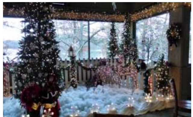
Beautiful Christmas decoration for our WCGA luncheon was enjoyed by all.