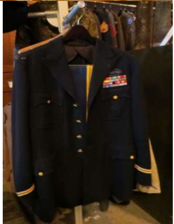
A very special thank you to our tour guide and owner for sharing the "Military Tribute Collection" with us.