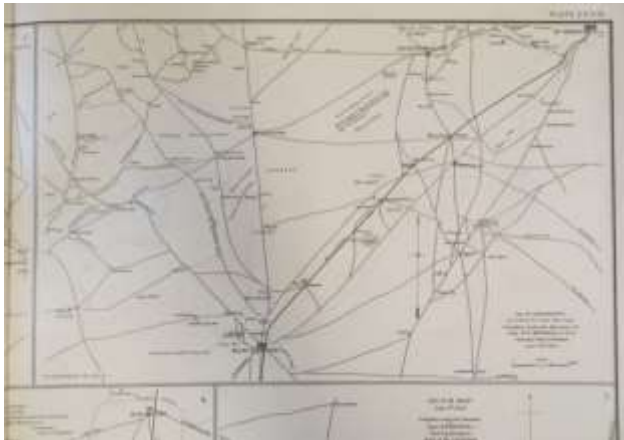
A map of the area dated July 5, 1863