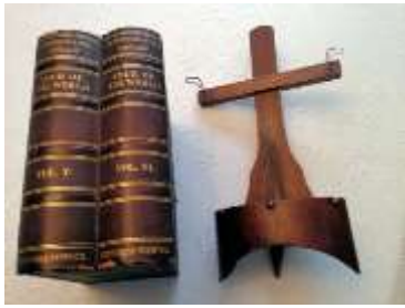
Pat Berges – Stereopticon patented 1885 with 1920 Trip Around the World stereopticon cards