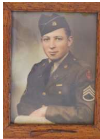
Photo of unknown WWII soldier which will be published in the newspaper in hopes that someone can identify him