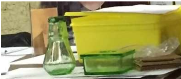
James Sandlin – Littleton Randolph Sandlin photos and Depression glass butter dish and molasses pitcher