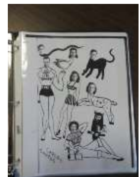
Centertown Echoes 1948