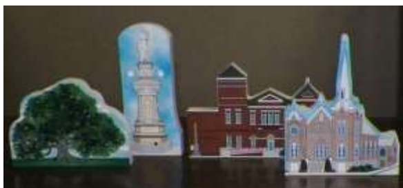
Our four keepsakes are, L-R: The Birthing Tree, Hebe Statue, Warren County Courthouse and First Methodist Church in McMinnville.