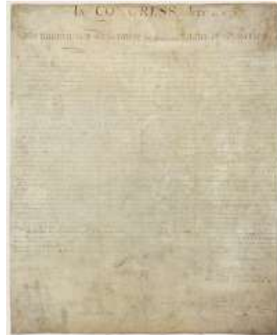
Declaration of Independence information taken from the U.S. National Archives and Records Administration