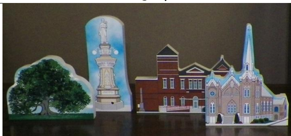
Our four keepsakes are, L-R: The Birthing Tree, Hebe Statue, Warren County Courthouse and First Methodist Church in McMinnville.