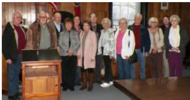
Part of our group pictured in the Chancery Court room located in the old county courthouse.