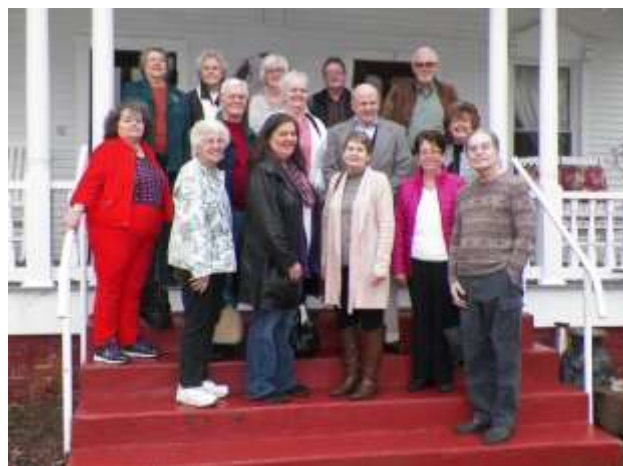
Our group poses for a quick photo outside of the Patch House. We enjoyed a wonderful meal in the Tea Room.