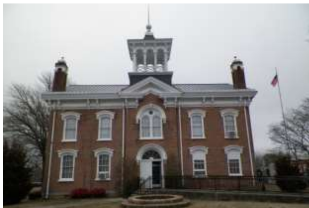
The Coffee County Historical Society is located on the ground floor of the beautiful old Coffee County Courthouse.