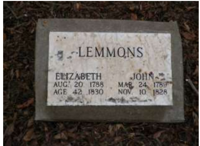
The oldest stone in the Fountain Springs Cemetery located on the Old Shelbyville Road.