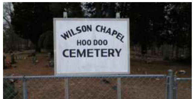
The Hoo Doo Cemetery located on the Old Shelbyville Road just out of Beech Grove in Coffee County.