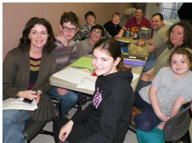
Boy Scout Troop 888 from McMinnville was among the large crowd attending the workshop.