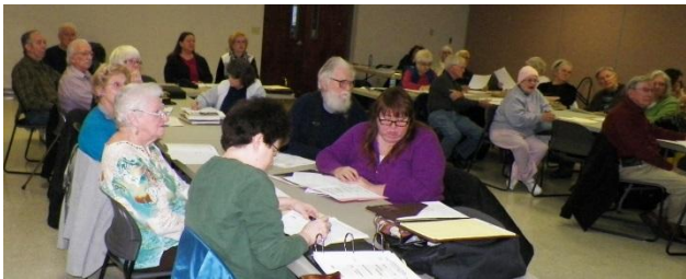
A large crowd participated in the workshop.