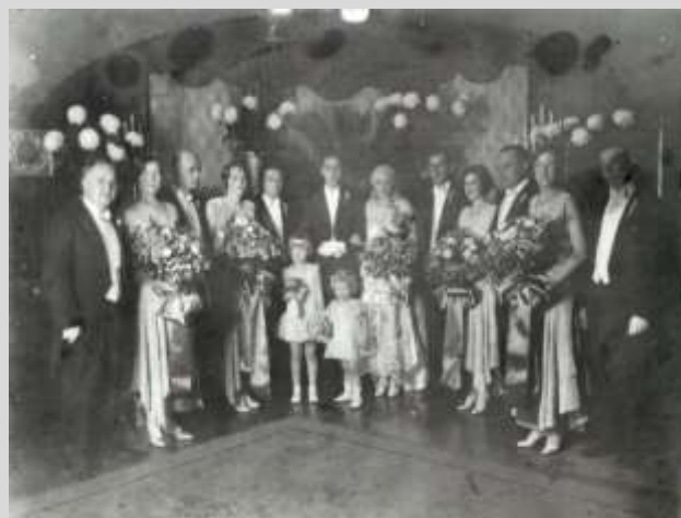
Can you identify anyone in this picture?