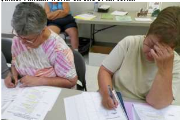
Two of our guests concentrate on their charts.