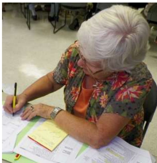
Filling in the blanks

Due to the large number of our members attending the Ancestry.com Seminar in Nashville, the September 20, 2014 meeting of the Warren County Genealogical Association has been cancelled. See you all on Oct. 18.