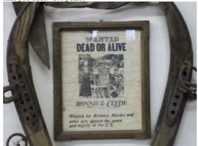
This set of halter trees frame the wanted poster of Bonnie and Clyde, the famed bank robbers from the 1930s. This is just one of many items that you will find in the old country store.