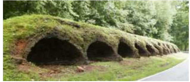
Coal ovens, used to make Coke, are located along the route to the Turner museum.