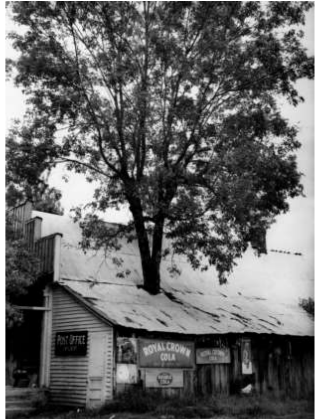
This photo was recently purchased by Norman Elrod and submitted for publication to the Newsletter. The following information is included on the back of the photo.

Since the establishment of Warren County in 1807, seventy eight post offices were located in the county. Only 6 presently exist: Campaign, McMinnville, Morrison, Rock Island, Smartt and Viola.