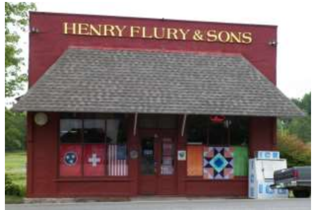
5 th Stop “A Diamond in the Rough” could best describe this old country store located in Tracy City. This place can easily take you back 100 years.