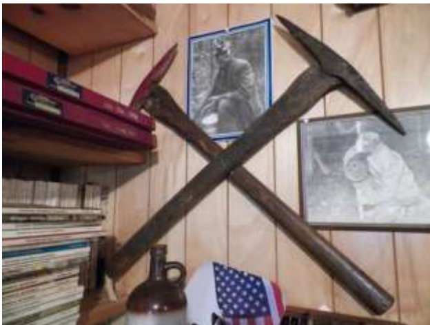
These coal picks, along with thousands of newspapers, pictures and postcards, are stored at Mr. Turners museum.