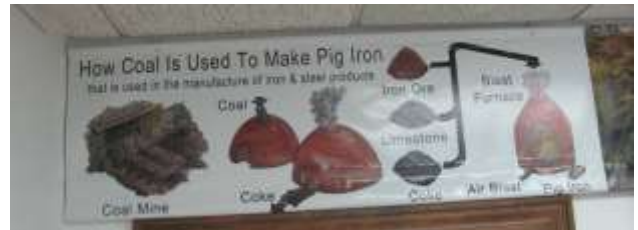
This chart explains how coal was turned into coke in the process of making Pig Iron.