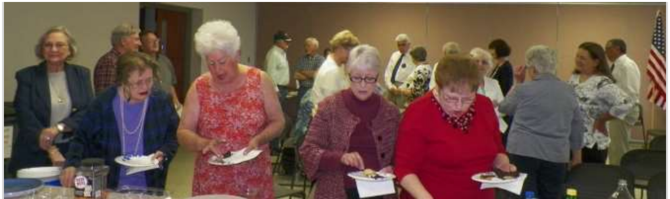
Refreshments are always good at our meetings and our April gathering was no exception. Several members attest to that following an enjoyable meeting.