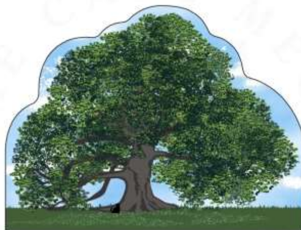
The third in a series of keepsakes, The Birthing Tree, located in McMinnville, TN has been approved and ordered. They should be available at the February 15 WCGA meeting. The price is $18.

Please make your checks payable to the Warren County Genealogical Association and can be brought to our next meeting or mailed to WCGA, P.O. Box 411, McMinnville, TN 37111