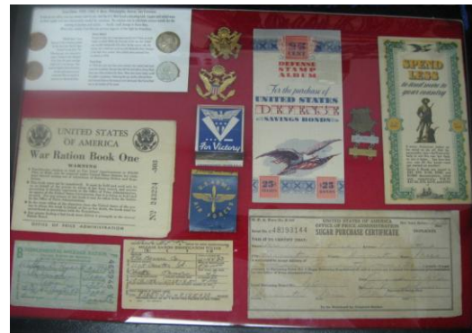
Various letters and ads from WWII