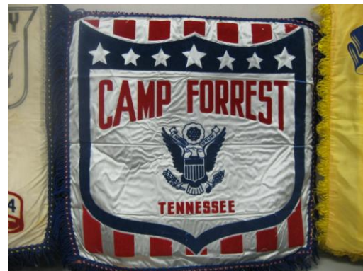
“Sweetheart pillowcase” from WWII