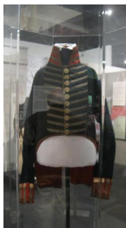
Uniform worn by American officer in War of 1812

painted portrait of George Washington. It was also during this war that "The Star Spangled Banner" was written by Frances Scott Key. WCGA thanks the Tennessee State Museum for an educational and entertaining experience!!