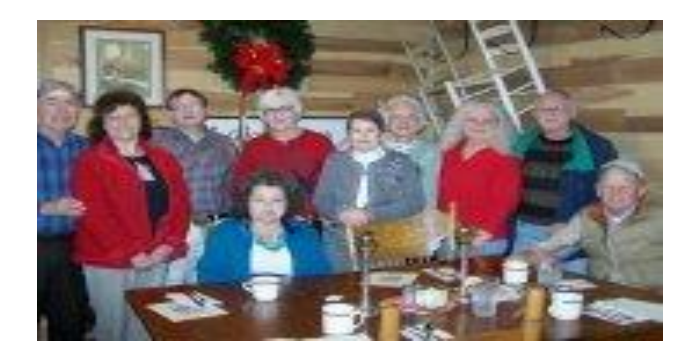
WCGA members were treated to a delicious breakfast and a tour of the grounds. WCGA would

like to thank the owners of the Readyville Mill for their kindness and hospitality!!