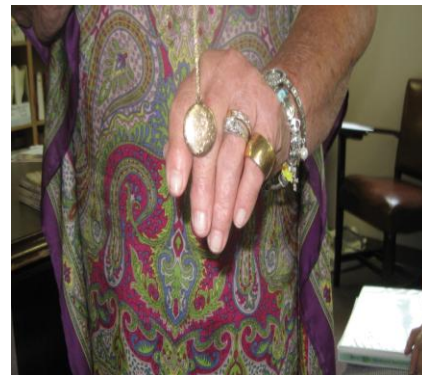
Locket and ring that were worn in wedding photo