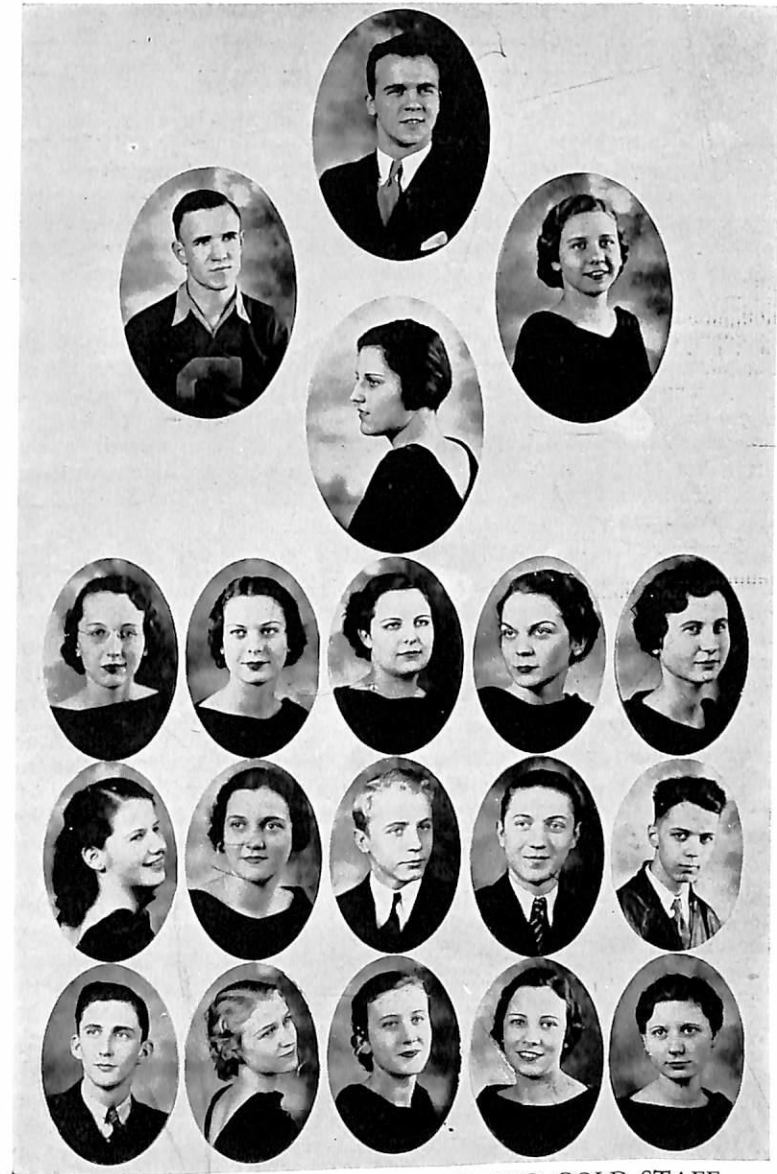
1936 CLASS OFFICERS, PURPLE AND GOLD STAFF