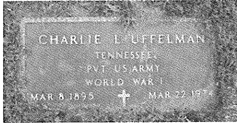
Added by LesaK