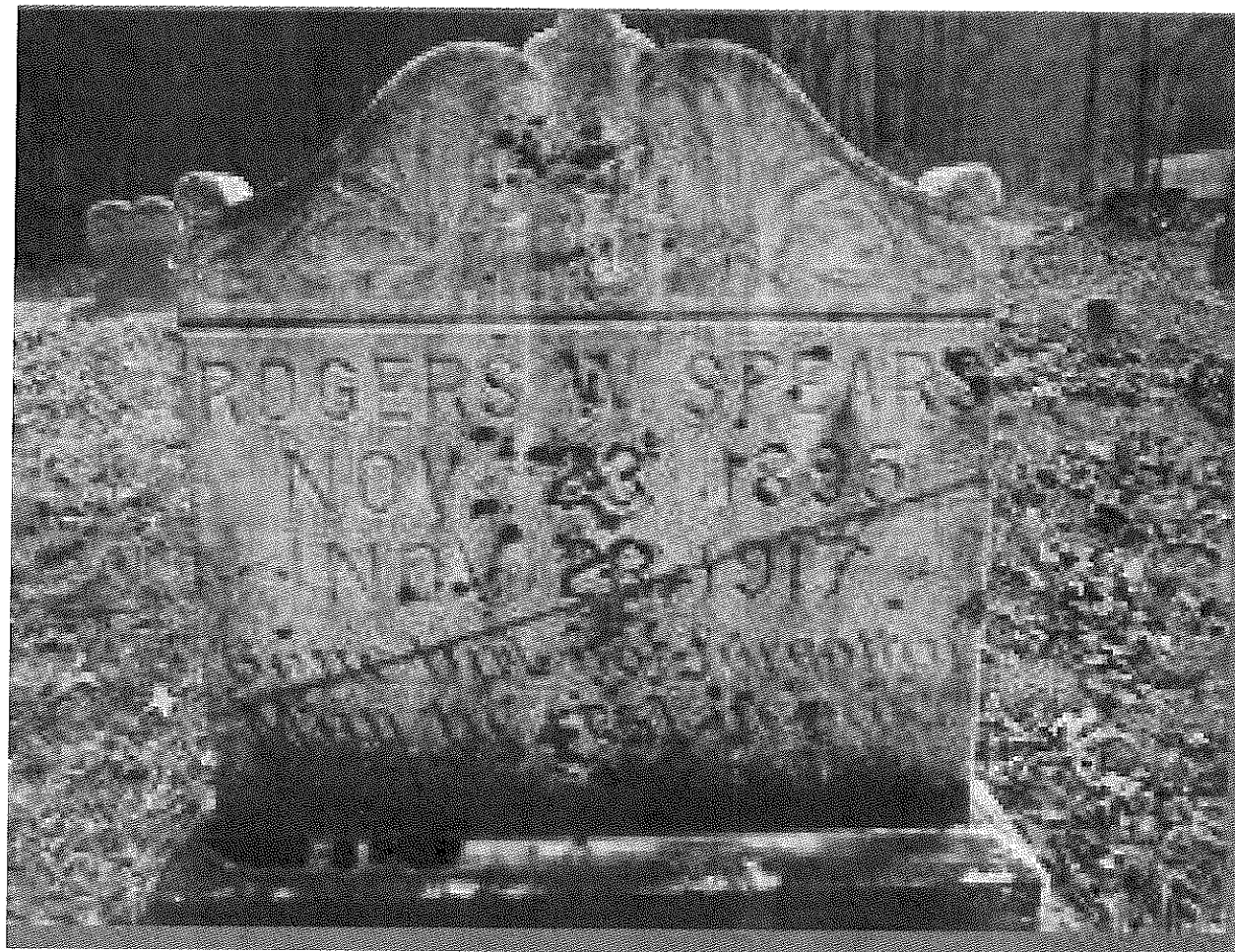
ROGERS W. SPEARS